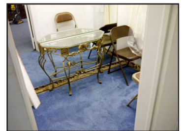
After our labor